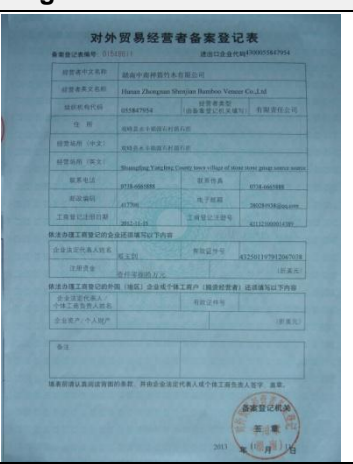
Certification & Photos -- Export Bamboo/Wood/Grass Products Manufacture Enterprise Register Certificate