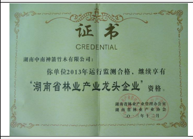
Certification & Photos -- N/A